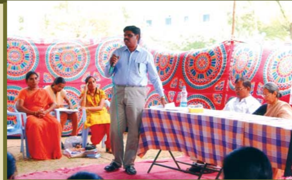
Working with government to improve quality of education

To date 221 families have received recognition for rights over 814 acres of land. Fifty claims filed by independent women have been recognized. Other claims are being processed. Support for the programme is provided by SDTT.