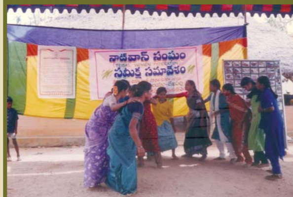
Training Koya women leaders