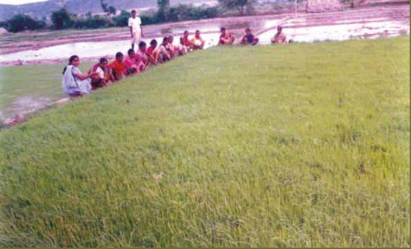
Promoting non-chemical approach in agriculture