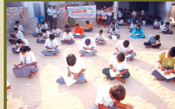
Writing on national issues