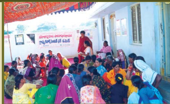
Discussing Womens' rights

The lambada tribal hamlets and other villages of Chandampet and Devarkonda mandals of Nalgonda district. The area is semi-arid and extremely under developed with an eroded resource base. Farmers in the area are caught in a debt trap, attempting to grow cash crops such as cotton. In spite of the National Rural Employment Guarantee Act, 2006, families continue to migrate for five to six months in a year putting at risk their children's education and health.