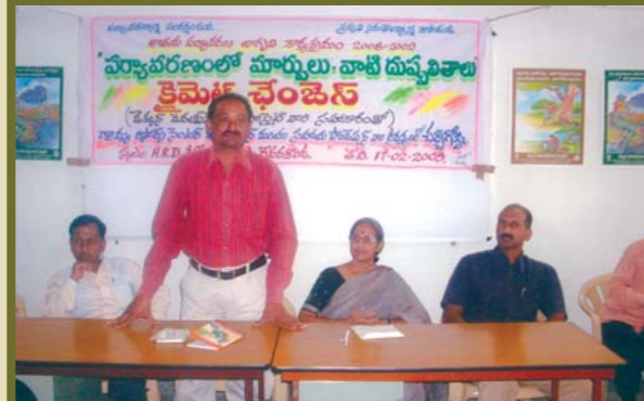
Creating awareness about climate change