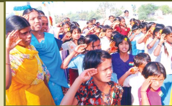
Saluting the country