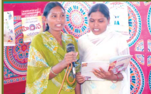
Campaign for child rights