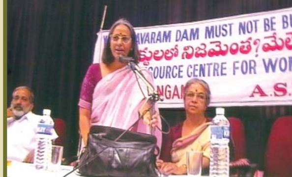
Supporting people's struggle against displacement