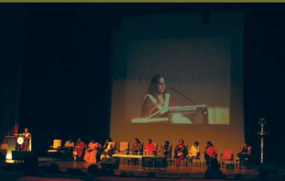
Anti dowry campaign