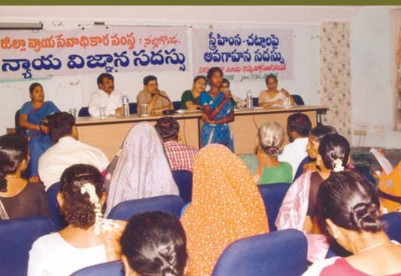
Creating legal awareness to access rights