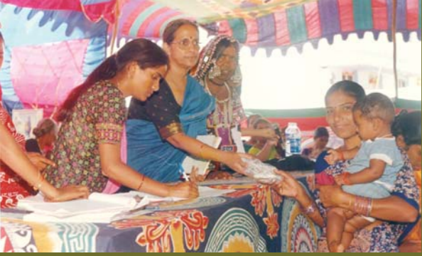
Supporting the girl child