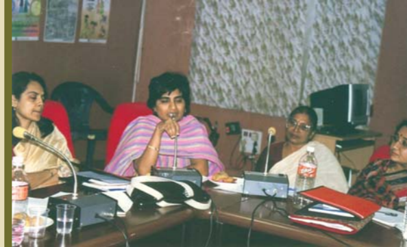
Influencing the state government and the World Bank