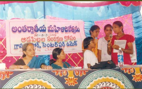
Ensuring girl child protection