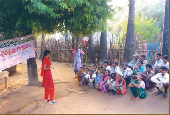
Koya women and men determined to access Forest Rights