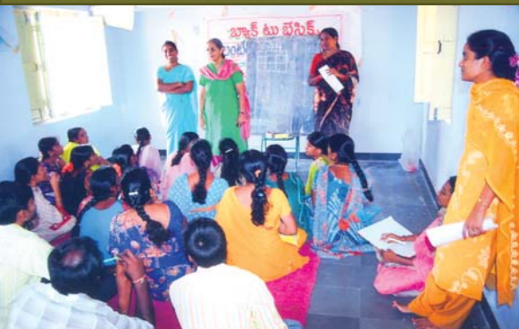
Back to basics joyful learning