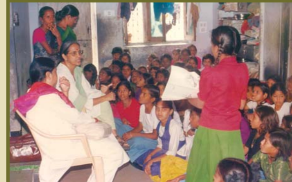
Active learning in school