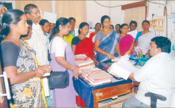
Demanding gender sensitive disaster management